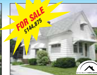
3014 Grand St. NE Hotline #45498