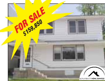
1431 4th St. NE Hotline #45703