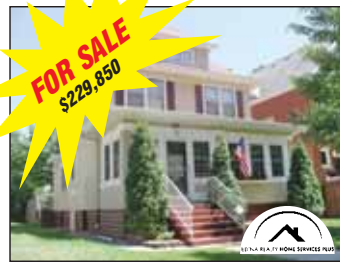
2219 Polk St. NE Hotline #45492