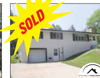
668 47th Ave. NE Hotline #45709