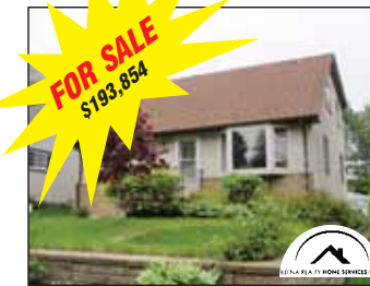
3971 Quincy St. NE Hotline #45486