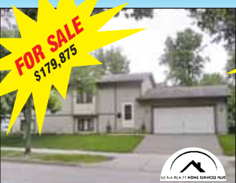
1030 26th Ave. NE Hotline #45505

Home seller marketing at its BEST • Celebrating 25 years proudly SELLING & PATRONIZING "NE"