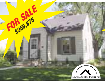
3019 Cleveland St. NE Hotline #45491