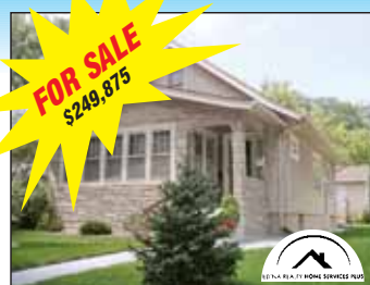
2522 Cleveland St. NE Hotline #45477