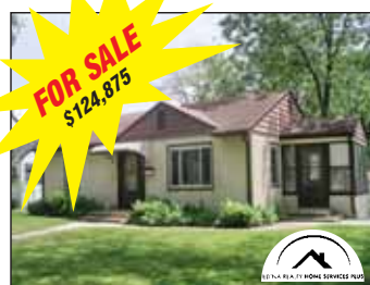
3959 Tyler St. NE Hotline #45473