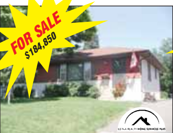
3807 Johnson St. NE Hotline #45483