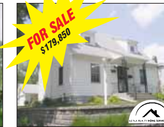
3000 Benjamin St. NE Hotline #45480