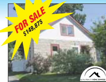
2633 Pierce St. NE Hotline #45504